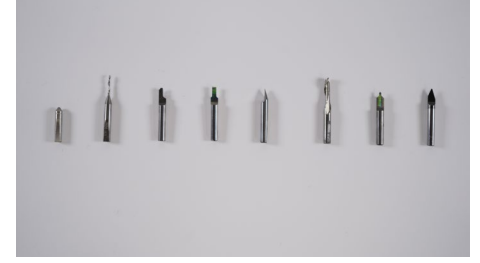
Cutters & Inserts